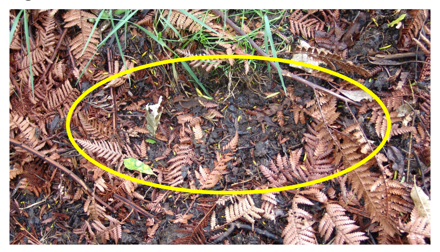
Depressions and leveling out of an area.