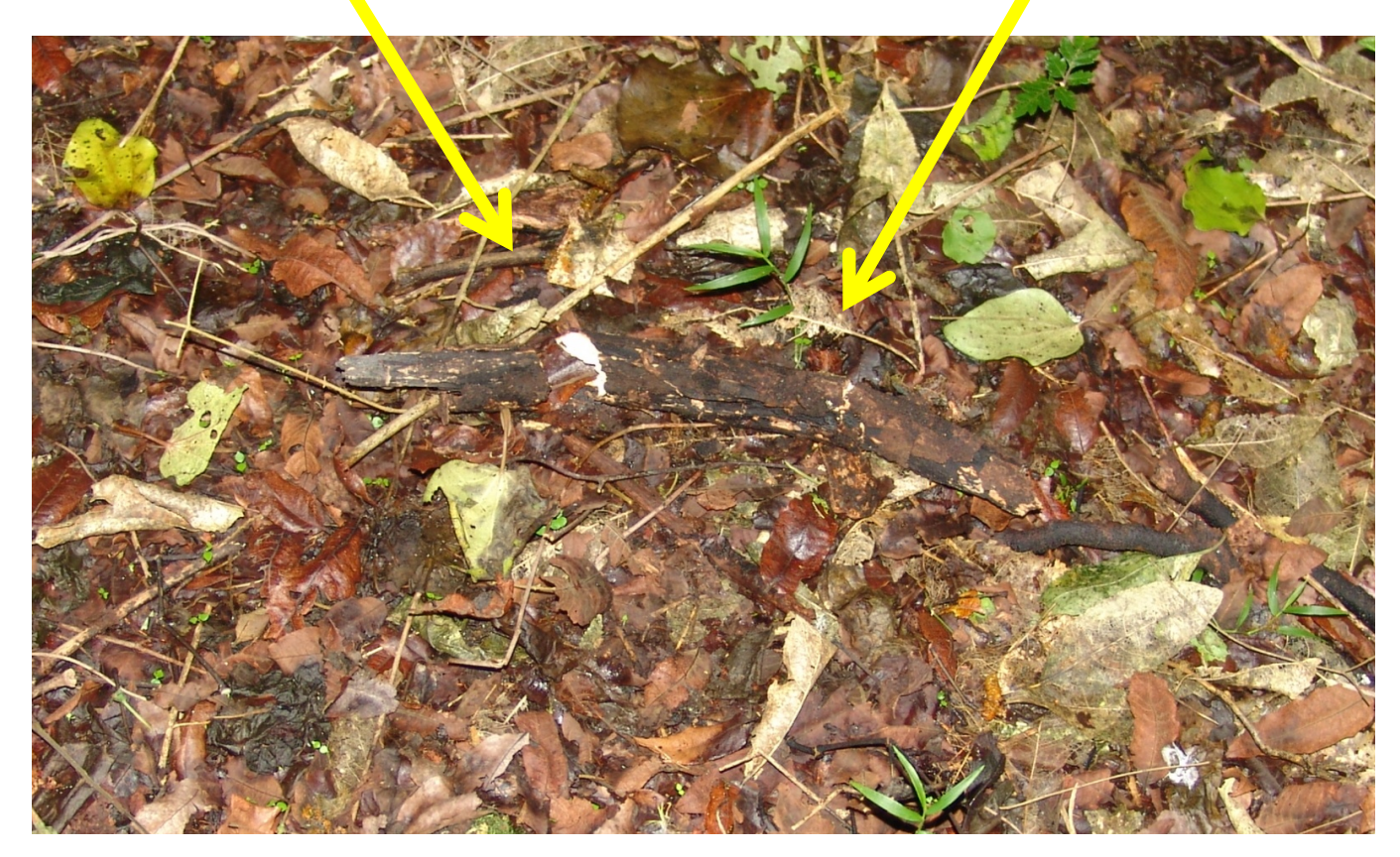
A foot fall will break a stick in two places.