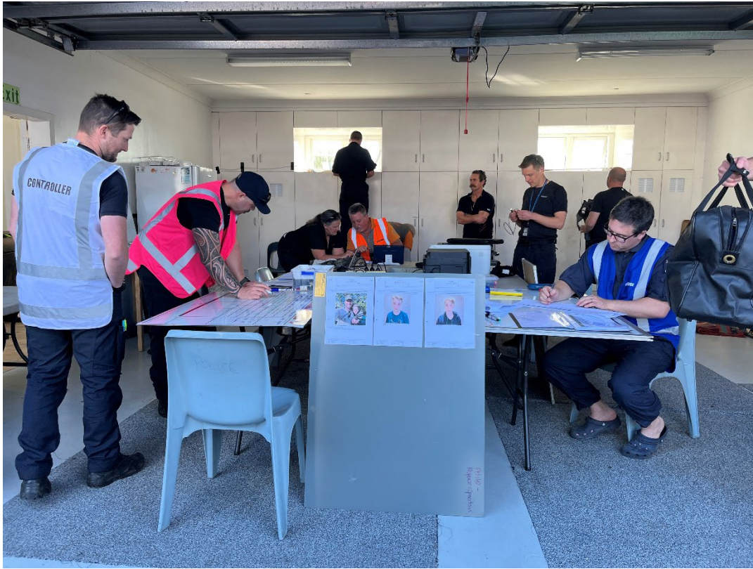
Briefing LandSAR and Police Field teams